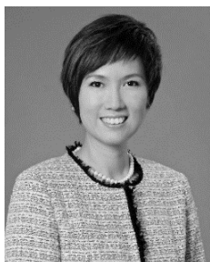
Patron Mrs Josephine Teo Minister, Prime Minister's Office & Second Minister for Manpower & Second Minister for Home Affairs