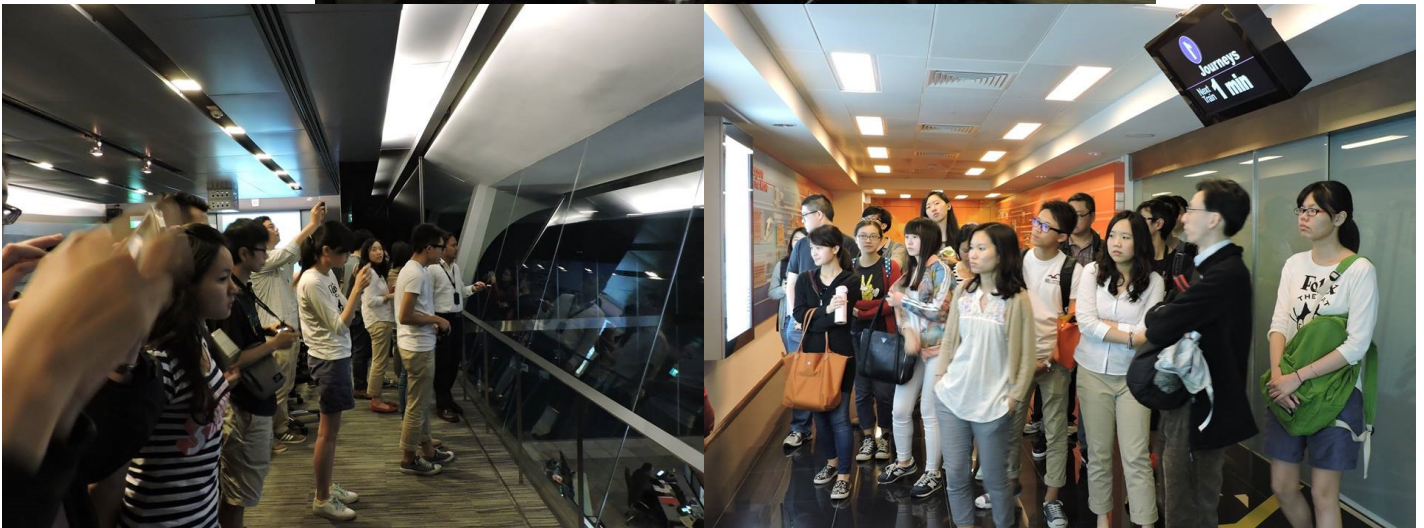
University of Hong Kong Students Training Programme on day 1-site visits

A group of 18 University of Hong Kong MATPP Students were with CILTS for a training programme lasting for three days from 9 to 11 March 2015.