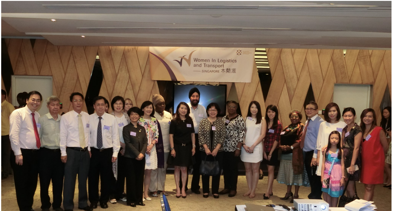
A group photo taken at the Inaugural ceremony.